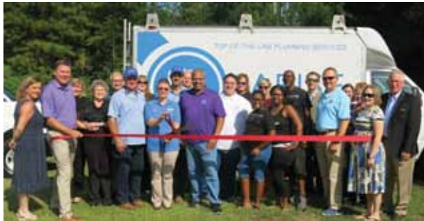
Arise Plumbing Service