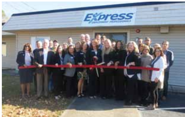
Express Employment Professionals