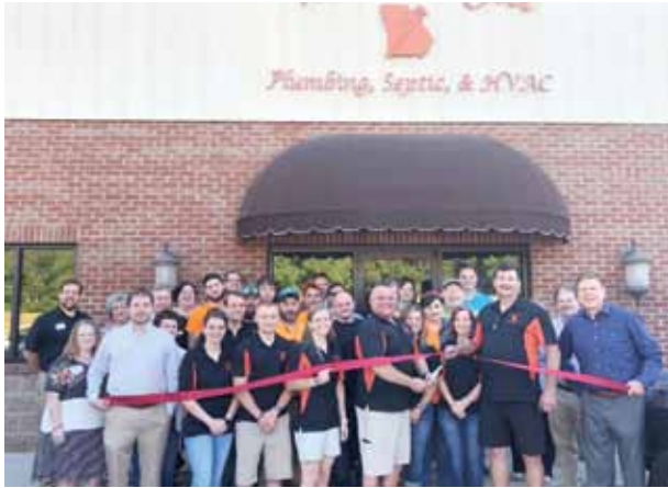
West Georgia HVAC

The highlights of the year are groundbreakings and ribbon cuttings! Here are just a few of the many celebrations in which we participated. Congratulations!