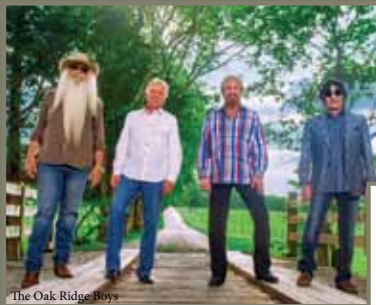
The Oak Ridge Boys